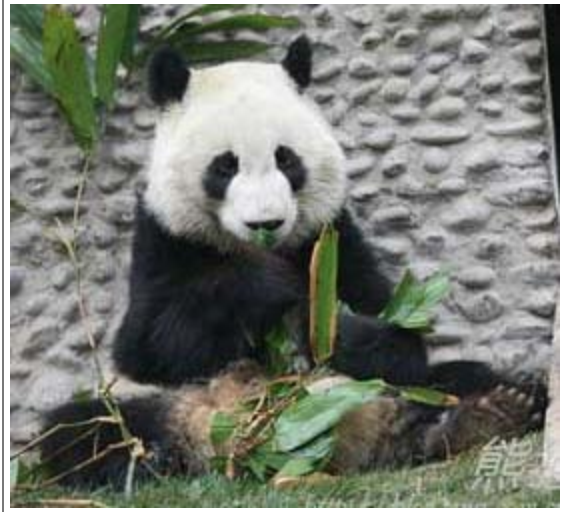
Photo Gallery of Mei Lan from Chengdu Base http://blog.sina.com.cn/s/blog_49246d360100h76a.html