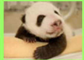
Si Jia– (girl)