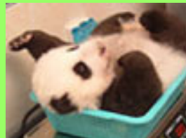
Cui Cui – (girl)