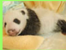
Tao Tao – (boy)