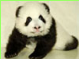
Su Xue – (girl) meaning