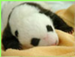
Mei Xi– (girl)