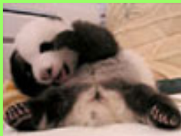
Lang Lang – (boy)