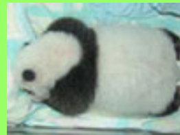
Qain Qain – (girl)