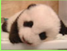
Meng Meng – (girl)