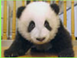
Huan Huan – (boy)