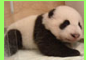
Duo Duo – (girl)