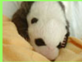
Mei Xin– (girl)