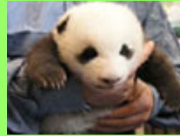
Fu Wa– (boy)