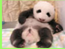
Mei An – (girl)