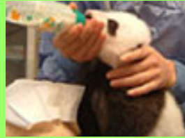
Fu Ni– (girl)