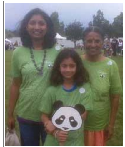
Three generations show off their new Panda tees!

We had a great time visiting with old friends of Pandas International and meeting new panda lovers. The help from our many supporters and volunteers enables Pandas International to make a significant impact at the Wolong Nature Reserve and the Bifengxia Panda Base.