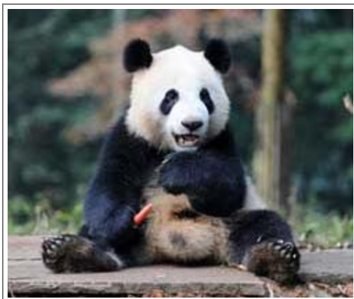
Male giant panda to be loaned to Singapore