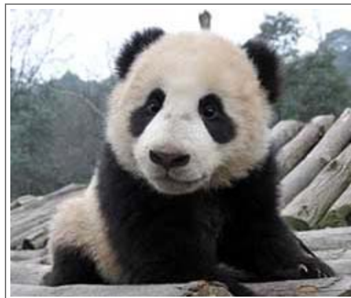
Female giant panda to be loaned to Singapore